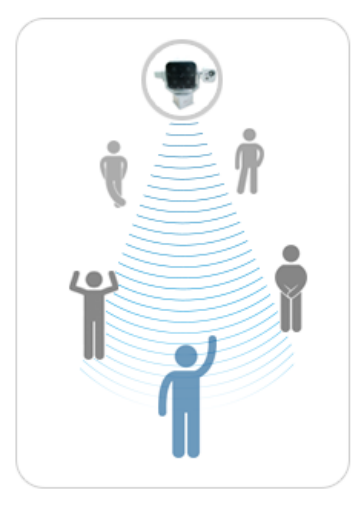
Acoustic Hailing Device